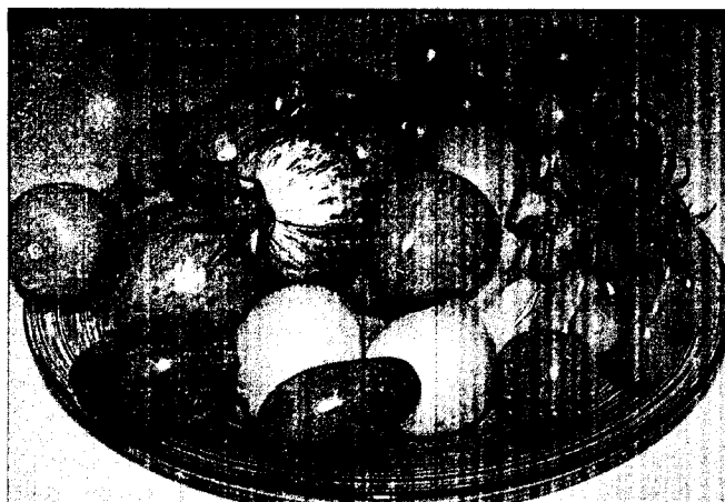
Figure 1 Heirloom tomato varieties

between-row and within-row distances were 150 cm and 30 cm, respectively. Plants were tied and pruned to one main stem. During the vegetation period, regular foliar fertilization was applied with 0.3%-os Volldünger Linz 14-7-21 fertilizer and green insecticides were used against pests ( Trialeurodes vaporariorum ). The plants were irrigated with drip-irrigation.