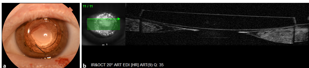
Fig. 2 a Left posterior capsule thickening in anterior segment photograph 12 months postoperatively. b Well-positioned intraocular lens with clear central area on the thick posterior cap-

depicted in right anterior segment optical coherence tomography image 14 months after surgery