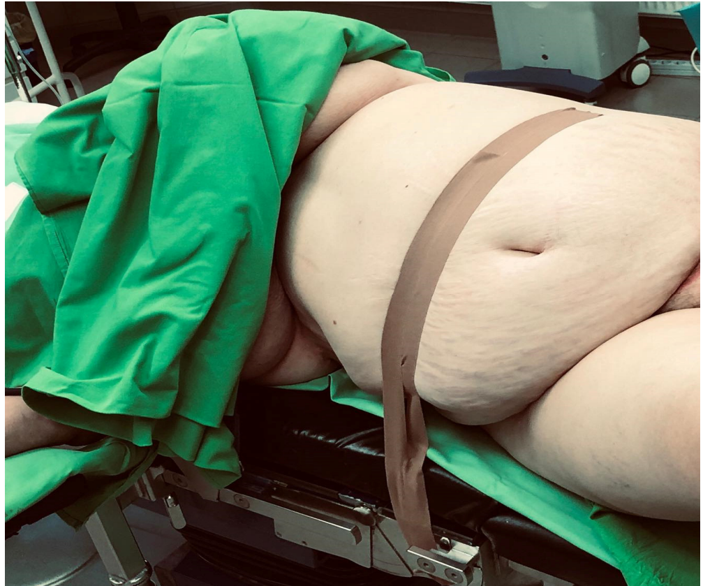
Figure 2. In obese patients, adhesive tapes were used on the abdomen.