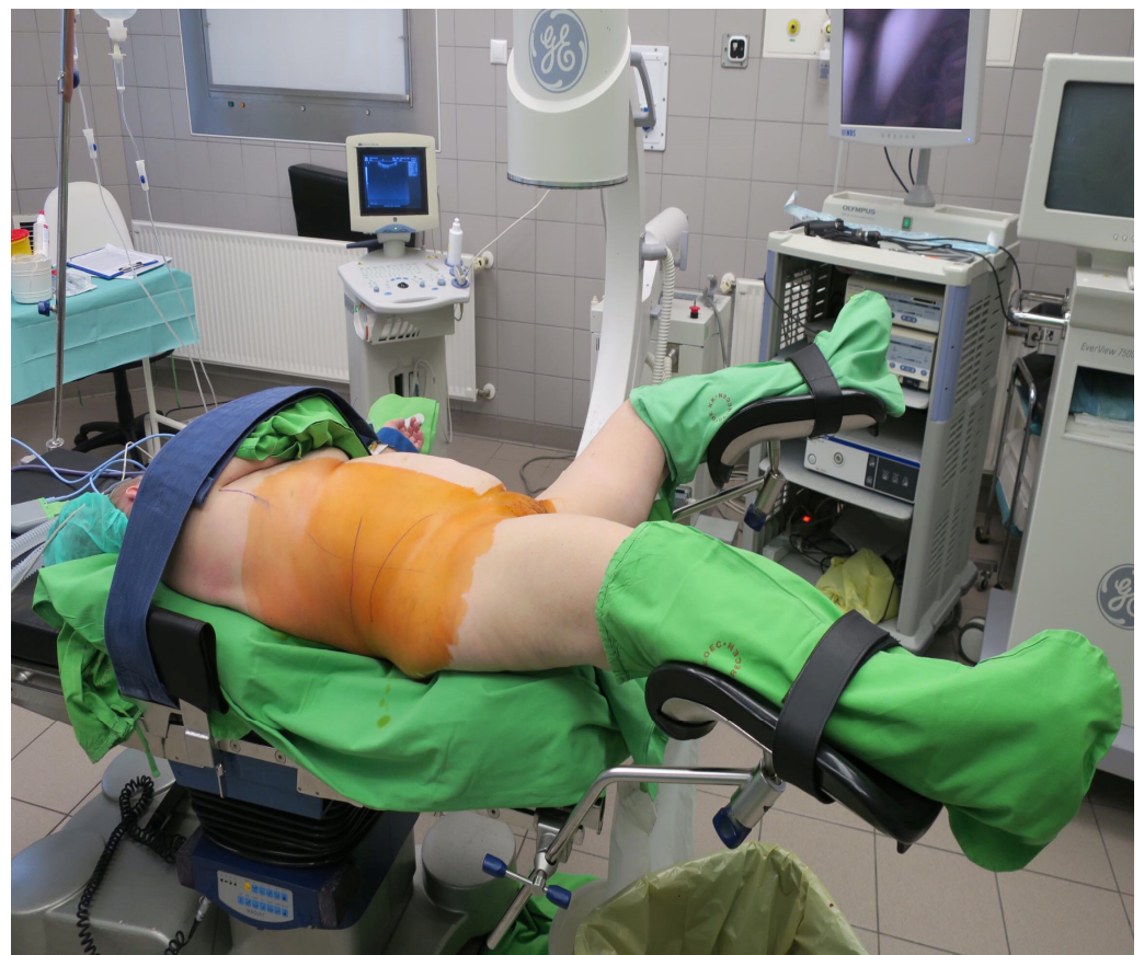
Figure 1. The Barts 'flank-free' modified supine position.

obese patients, adhesive tape was used to shift the abdomen towards the contralateral side (Figure 2). Key anatomical landmarks, including the posterior axillary line, rib line, and iliac crest, were marked on the patient (Figure 3). A 19 Ch rigid cystoscope (Urotech GmbH, Achenmühle, Germany) was inserted to identify the ipsilateral ureteral orifice, and a 5 Ch open-end ureteral catheter (Urotech GmbH, Achenmühle, Germany) was advanced into the ureter. Ultrasound (Mindray Diagnostic Ultrasound System, Consona N9, Shenzhen, China) assessed perirenal anatomy, the position of adjacent organs relative to the kidney, and target calyx selection. An ultrasound-guided, fluoroscopically adjusted puncture was performed using an 18-gauge needle (Cook Incorporated, Bloomington, IN, USA) under the posterior axillary line, advancing a 0.035 mm hydrophilic guidewire (Roadrunner ® , Cook Incorporated, Bloomington, IN, USA) into the ureter. Dilatation was achieved using an Amplatz renal dilator set (Cook Incorporated, Bloomington, IN, USA) under fluoroscopy, followed by the placement of a 28 Ch Amplatz sheath and a 25 Ch nephroscope (Olympus Winter & IBE GmbH, Hamburg, Germany). The guidewire ensured safety throughout the procedure via the Amplatz sheath. Lithotripsy was performed using an ultrasound lithotripter (ShockPulse-SE Lithotripsy System ™ , Cybersonics, Inc., Erie, PA, USA).