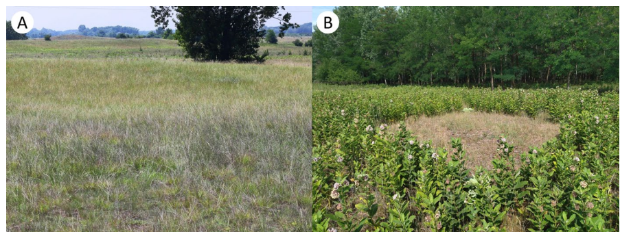
Fig. 1 Native steppe vegetation with scattered woody vegetation on an old abandoned cropland in the Kiskunság Sand Ridge, Central Hungary (A). A 5 m×5 m treatment plot within a common milkweed stand (B)

Considering the biomass and soil moisture data from 2021, we assigned one of the milkweed plots into a treatment group and a control group so that the averages of the two groups were as similar as possible in terms of the measured variables. In the treatment groups we manually removed all aboveground parts of milkweed stems three times during the growing season of 2022 (in late April, mid-May and mid-June) (Fig. 1). In total, we removed