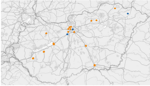
Fig. 1. Overwintering sites of jumping plant-lice in Hungary. Blue and orange spots indicate known and newly discovered localities, respectively

nordmanniana ), giant redwood ( Sequoiadendron giganteum ), Atlas cedar ( Cedrus atlantica ), common yew ( Taxus baccata ), Douglas fir ( Pseudotsuga menziesii ), European black pine ( Pinus nigra ), blue spruce ( Picea pungens ), savin juniper ( Juniperus sabina ), and Leyland cypress ( Cupressocyparis leylandii ).