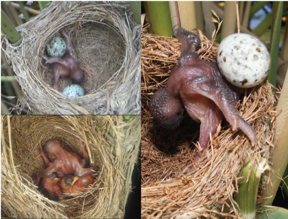
Figure 1. Hatchling common cuckoos in the process of evicting host eggs and chicks from great reed warbler nests. doi:10.1371/journal.pone.0007725.g001

cohabit with host nestmates, they would face permanently costly competition for foster parental care [15] and suffer from lower growth [5,6,15] or very high mortality [5,16]. Therefore, the window of virulence by cuckoo parasites appears to be open only briefly after the cuckoo chick hatches [12].