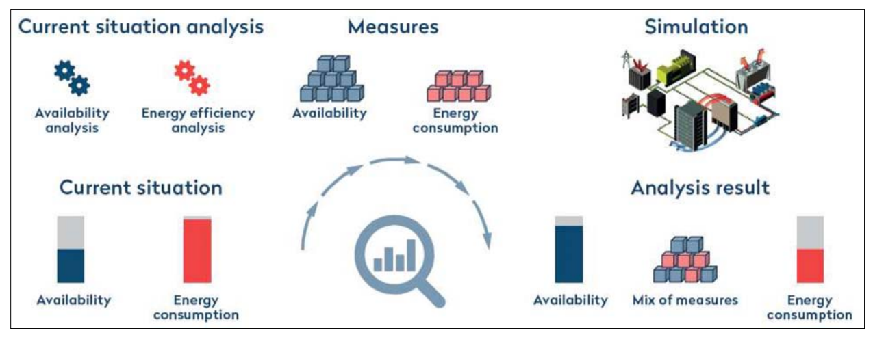
Fig. 2. FMECA/RAM/Energy Analysis Approach

As a first step in this study, two site visits were accomplished in order to get insights into the DC and how different systems are operating together. Basic information for the FMECA session were also collected including site and building plans, schematics, descriptions, screenshots, asset lists and energy consumption data. Afterwards, FMECA session was carried out by the project team in cooperation with the DC operation team in order to assess current risks and systematically identify potential failure mechanisms of all components. After generating a risk priority number to quantify the overall risk of each failure mode, components were categorised into three groups, non-critical, medium critical and high critical based on criticality assessment and in consultation with the data centre operator. As an output of the FMECA, high-risk components/failure modes were determined and six risk reducing measures were identified and discussed within Apleona's team. An example of such measures is to replace generator control units as this will reduce MTTR in case of a failure. Another optimisation measure is to install additional valves. This ensures that sufficient CRAC units are