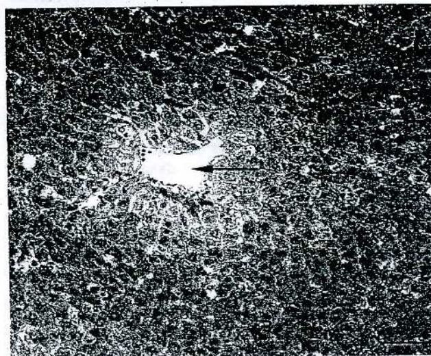
Figure 2. Hepatic lobule shows the beneficial effect of Újfehértói fürtös sour cherry treatment in hyperlipidemic animals (Arrow shows the vena centralis. Bar scale: 100 μm)