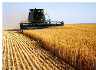
Fig. 4. Combine harvesting of ready wheat crop