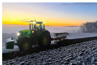
Fig. 3. Winter ploughing in progress