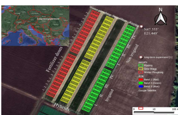
Fig. 2. Látókép Experimental Station of Plant Production (Debrecen, Hungary) – RCBD