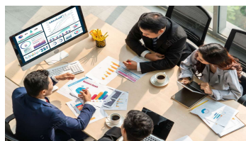
Fig. 1. Brainstorming for statistical analysis

Winter ploughing tillage is a common agricultural practice employed to prepare soil for the next planting season. This technique has the potential to influence a variety of soil and crop characteristics, mainly moisture content and grain hardness in wheat. The importance of these factors is a precursor to examining how winter ploughing influences the attributes. Wheat moisture content is critical for its storage and processing, while grain hardness highly determines the milling quality. Therefore, analysing the study data aims to provide valuable insights into the agronomic and economic implications of this tillage method on wheat production.