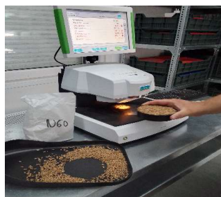
Figs. 7 & 8. Grain analyser. Using the grain analyser to determine wheat moisture content and grain hardness