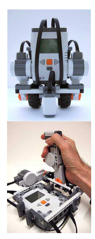
Figure 5. Made robot from NXT [11]