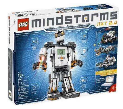
8547 NXT 2.0