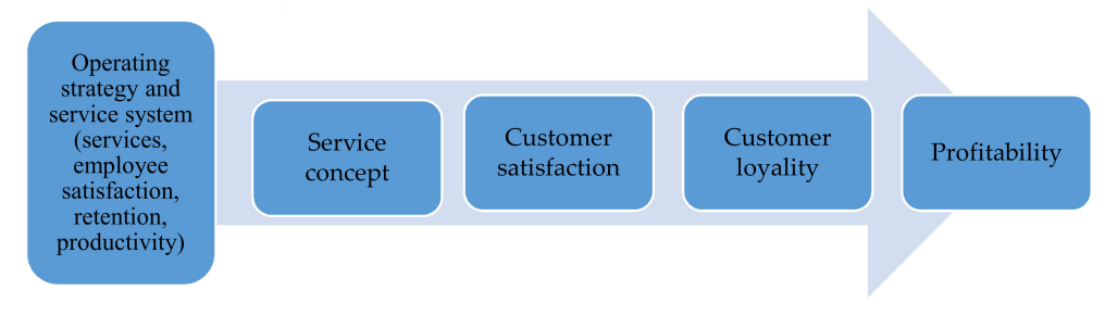
Figure 1. Service profit chain.

According to Figure 1, several factors are connected to customer loyalty and customer satisfaction. These factors include financial measures, lending, deposits, and a number of other services that are used by customers.