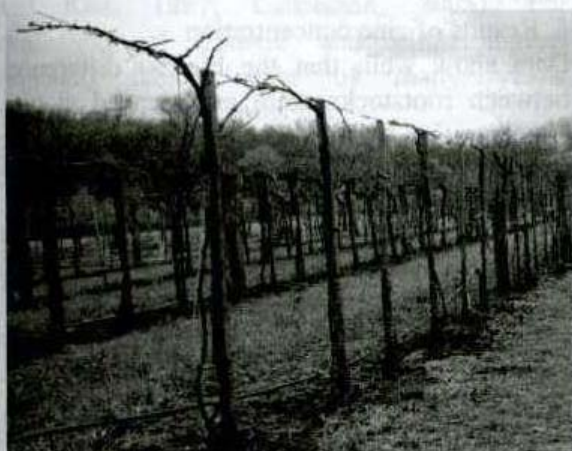
Figure 1. View from a grape variety collection of the University of Debrecen, Centre of Agricultural and Applied Economic Sciences

Grape variety collection of the University of Debrecen, Centre of Agricultural and Applied Economic Sciences was established in 2003 on immune sandy soil with 3m between row and 1m between vine spacing. 28 rootstock cultivars of the collection were trained to bald head system with one bended wire technology. In 2010 grafting of 'Cserszegi fűszeres' (also called 'Woodcutters' white') on 14 rootstocks out of the 28 was started with woody-green grafting in May, following with green grafting up to 20 th of June. On vines grafted in place the scion was situated between 50-150 cm height. Scion was trained to single curtain training system (Figure 1.).