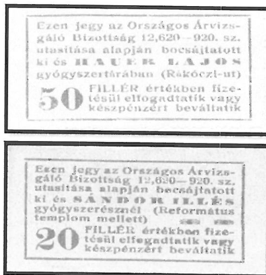
Fig. 6 Notes issued by private pharmacists in 1919.

Denominations: 10 Fillér, 20 Fillér. Thin blue paper was used with black printed Hungarian text, size: 30 × 27 mm.