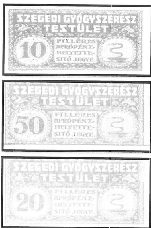
Fig. 5 Notes issued by Association of Pharmacists in a Hungarian town (Szeged) in 1919.