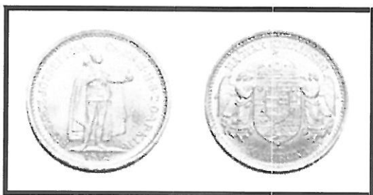
Fig. 1 10 Korona gold coin from 1892.

on September 30, 1878 was matching that of the biggest European central bank by the turn of the century. The majority of this gold reserve was provided by Hungary with its grain export and the issuance of bonds [21]. As a background, during the Crimean War (1854-55) and the American Civil War (1861-65), both the Ukrainian and American grain disappeared from the world market.