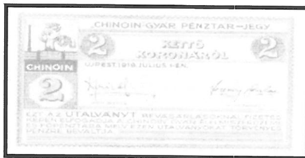
Fig. 4 A note issued by factories (Factory Chinoín) in 1919.

Another pharmacist, called Daubner József, from Homokszől issued it between 1915 and 1916. Denomination: 10 Fillér, white paper with black printing in Hungarian and in German, size: 114 × 50