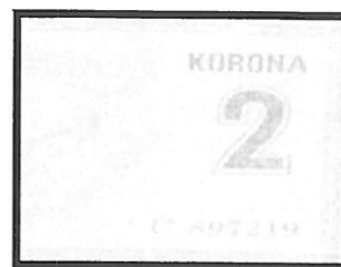
Fig. 2 The 2 Korona bank note issued on August 5, 1914, was simply divided into two.

The lack of appropriate amounts of small change led to the practice well known throughout history; the 2 Korona bank note issued on August 5, 1914 was simply divided into two (Fig. 2) [22]. Therefore, the Austro-Hungarian Bank hurriedly released Korona 1 dated on December 1, 1916. That step did not seem to