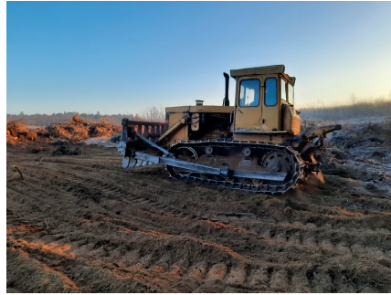
Figure 1. Stump depositing is in progress (HP 7 H)—original photograph taken by the author István Attila Kocsis.

The maximum humus content was found in the top 0–30 cm layer. At depths below 30 cm, we determined a humus content of less than 0.1% in each soil profile before plowing. After plowing (Figure 2), samples were extracted from depths of 0–30 cm and 30–70 cm, as well as from the rows where the stumps were deposited.