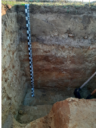
Table 5. The soil profile of the Hosszúpályi 8 M higher-lying area is brown forest soil with alternating thin layers of clay substance (WRB Arenosols). Original photograph taken by the author István Attila Kocsis.

Table 5 displays the soil profile of the Hosszúpályi (HP) 8 M forest area, while Table 6 includes the measurements performed.