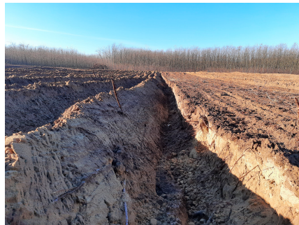
Figure 2. Deep plowing is in progress (HP 4 L)—original photograph taken by the author István Attila Kocsis.

The maximum humus content was found in the top 0–30 cm layer. At depths below 30 cm, we determined a humus content of less than 0.1% in each soil profile before plowing. After plowing (Figure 2), samples were extracted from depths of 0–30 cm and 30–70 cm, as well as from the rows where the stumps were deposited.