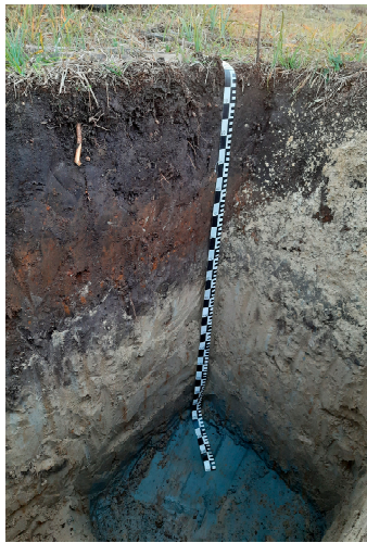
Table 7. The soil profile of the Hosszúpályi 8 M deep-lying area (meadow soil; WRB Chernic Gleysoil).