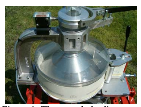
Figure 1: The cone-belt dispenser

At the beginning of the plot - when the process starts - the supply cylinder is lifted, and the particles fall down on the surface of the cone. The granule is fed into the supply cylinder and collected on the head of the distribution cone. Finally the granule is driven into the groove, located between the base of the cone and the rubber conveyor belt. The granule is moved by the rubber conveyor belt, driven by the cone. The cone with surrounding rubber belt must make one revolution on the full length of the plot. The speed revolution of the cone can be adjusted by changing the sprockets between the ground wheel and the driven cone. There is a hole on the circle surface of the cone, where the particles discharge from the cone (Figure 1).