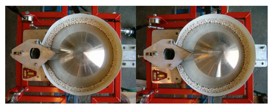
Figure 3: The fertilizer on the vertical and on the not vertical cone

I measured the mass of 216 g fertilizer located between the base of the cone and the rubber conveyor belt (Figure 3) in two cases. First when the axis of the cone was vertical (on the left side of Figure 3), and second, when there were 5 degrees between the vertical line and the axis of the cone (on the right side of Figure 3).