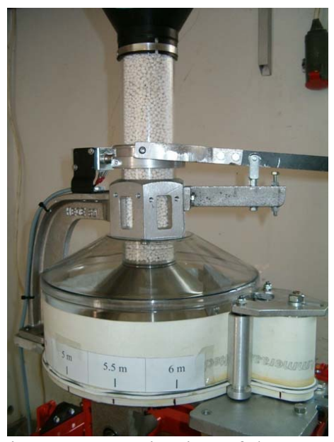
Figure 2: Examination of the conebelt dispenser

was adjusted horizontally and was calibrated to the sign of 0° on the wall. The frame of the cone can be adjusted in two directions by two levers of the eccentric wheel. The external part of the belt of the cone dispenser was separated into 12 segments (I tested the appliance by modelling of a 6 m long plot, so one segment was 0.5 meter). A given amount of fertilizer was filled into the supply cylinder, then the cone was turned over and 12 fertilizer samples were taken out. The quantity of fertilizer was measured with four types of fertilizers (the accuracy of the balance was 0.1 g). The adjusted tilt angles of the cone were set as follows: 1°; 2°; 3°; 4°; 5°. The supplied quantity of fertilizer was 216 g. I tested the appliance by modelling a 6 m long and 1.2 m wide plot.