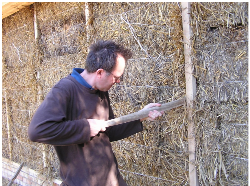
Fig. 5b Compressing of the straw in the wall