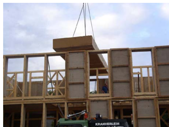
Fig. 2d Strawbale house in Tattendorf made of prefabricated blocks