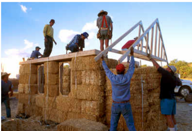
Fig. 1a Nebraska style (load-bearing) strawbale house during building

After a while, the appearance of up-to-date building materials and the development of the mobilization, made these houses fall into oblivion, but later, at about the energy crisis of the 70's, they were rediscovered again. Since then hundreds of them have been built all over the world. Today's economical and environmental crisis makes more and more people recognize the importance of environment and energy conscious buildings, so the strawbale houses are facing a great future.