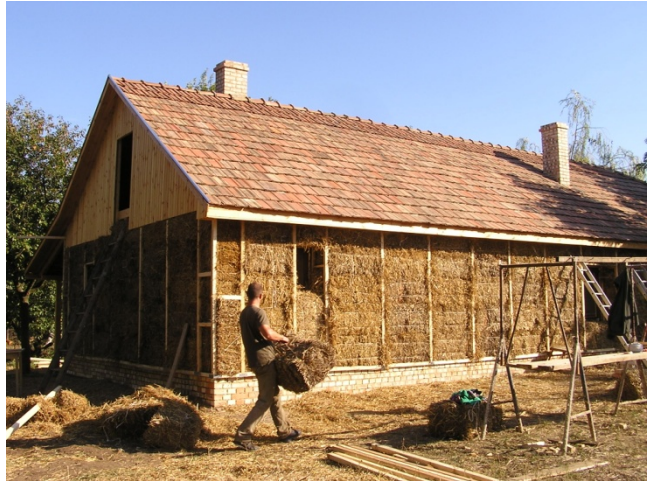
Fig. 5. Strawbale thermal insulation of an old adobe house