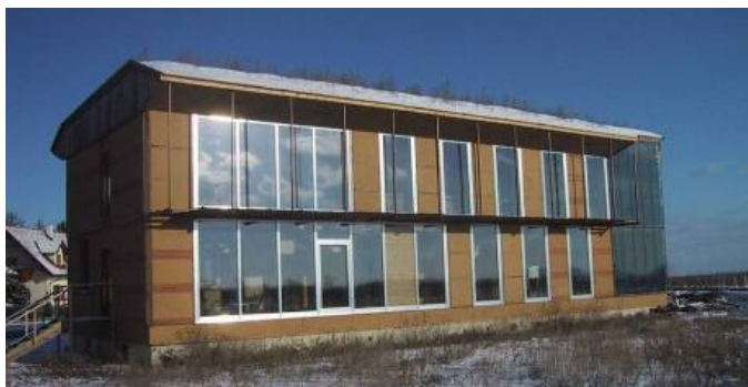
Fig. 2a Outer view of the strawbale house in Tattendorf (near Wien)

We can understand it better if we have a look at figure 2.b, which shows the overall CO 2 emissions (Corneliu, 2009.) by weight (kg) released by production of 1 kg of twenty-four common building materials. We can notice that in case of using natural organic building materials (straw, wood, cork) comparing to so called modern artificial ones (metals, synthetics, ceramics), we do not even increase the CO 2 contamination of the atmosphere, but reduce it. This makes it possible to get negative values instead of positive ones (like normally in case of artificial building materials) (Wihaan, 2007).