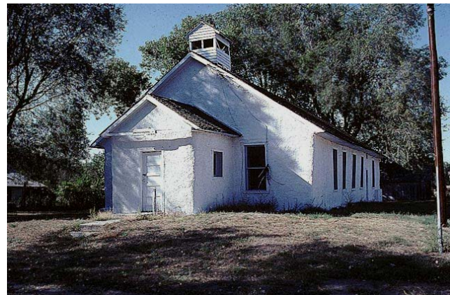
Fig. 1b Strawbale church from the USA (1927)