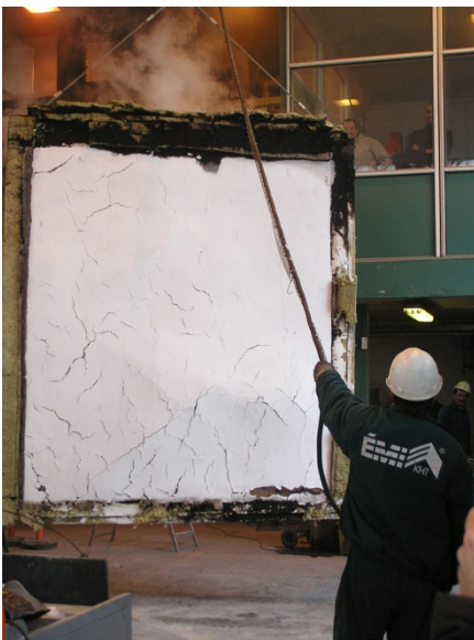
Fig. 3a Fire test of plastered strawbale wall at the laboratory of ÉMI in Szentendre (2008)

Although according to paragraph d) we have got the chance to build with unique (not serial) products, the content of the plans has not been specified by any law, so it is impossible to apply it. Due to the ambivalent laws, in spite of the increasing needs for eco-houses, natural materials like straw and adobe are pulled back.