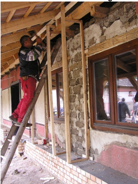
Fig. 5a Building of the wooden structure of the strawbale insulation wall of the adobe house