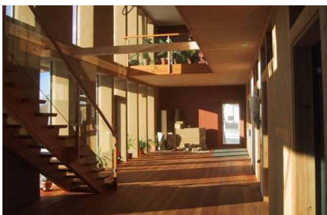
Fig. 2c Inner view of the strawbale house in Tattendorf (near Wien)