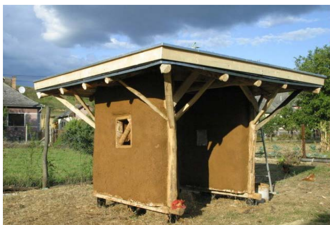
Fig. 4 Building of a strawbale hut in Mátraballa (2009)