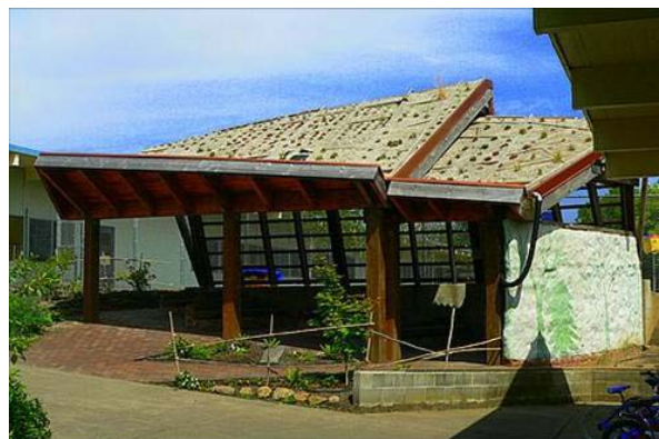
FIGURE 1: Outdoor classroom at Atkinson Elementary PTA

Initiatives can also be found in this field, but these concentrate on disabled people (see Section II.B).