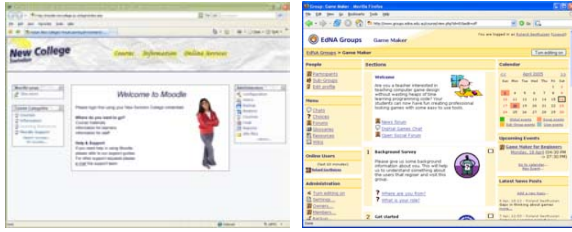
FIGURE 4. Different colors, different feelings. LCMS's have some built-in skins