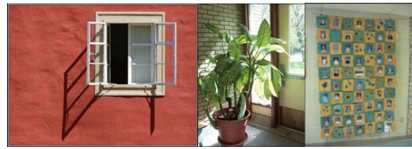
Figure 2. The building is given, but we have many possibilities for decorating it

An important condition for efficient learning is an agreeable and personalized surrounding APAS where the learner feels good. Essential is the appearance of the room (see Fig. 2 and 3), the book or the web page that he or she reads. Designs of e-learning systems must be acclimatized to the growing awareness of