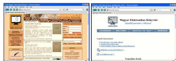
FIGURE 6. Home pages of the Hungarian electronic library for OSZK ( http://mek.oszk.hu )