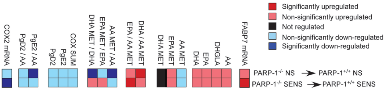
Figure 2. Eicosanoid and docosanoid signaling alterations in the skin of poly(ADP-ribose) polymerase-1 (PARP-1) -/- mice, due to enhanced fatty acid binding protein (FABP)7 expression. The FABP7 mRNA expression levels, and eicosanoid and docosanoid concentrations, were determined in the skin of control (PARP-1 +/+ NS), OXA-sensitized PARP-1 +/+ (PARP-1 +/+ SENS) and respective PARP-1 -/- mice (n=5/5/6/5). AA, arachidonic acid; DHGLA, dihomo-gamma-linoleic acid; EPA, eicosapentaenoic acid; DHA, docosahexaenoic acid; MET, metabolites; COX, cyclooxygenase; COX2, cyclooxygenase 2; Pg, prostaglandin.