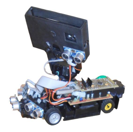
Fig. 1. Mechanical construction of the robot

The robot is a car-like vehicle with ultrasonic distance sensors and a 2 DOF consol for holding the Android phone. Two servo motors can change the yaw and pitch angles of the phone in 180^{\circ} . A third servo is responsible for steering the vehicle. Fig. 1 illustrates the mechanical construction of the robot.