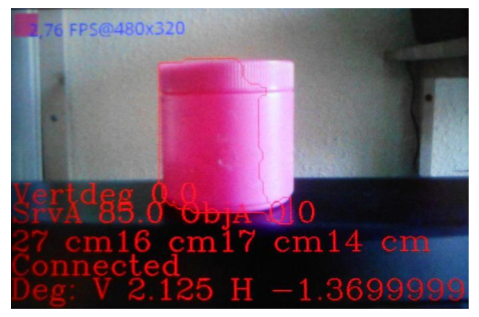
Fig. 3. Smartphone screen during color tracking

Table I. summarizes the frame rate results between the experimented color blob and face detector methods in respect to their different parameter setups.