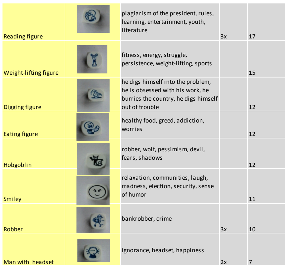
Table 2. : Primary associations

A quick overview of the first half of the table makes it possible to sense the negative universe that is evident at the level of primary associations. Although significantly more cubes align with positive meaning (17) than with negative (12), respondents connected even undoubtedly