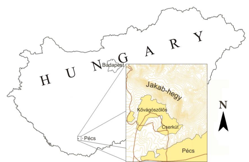
Fig. 1. The location of the surveyed area

The sample area was the South Jakab-hegy (part of the Mecsek) with area of 700 hectares (Fig. 1). The territory contains built-up areas and forest, mainly oak and beech (Fig. 2). The Jakab-hegy has important role in tourism and forestry, and several geological researches took place here, for instance many roads were created to connect the prospect holes of the uranium mining with the existing roads. The elevation is between 210m and 590m, while the slope varies between 0° and 35^{\circ} .