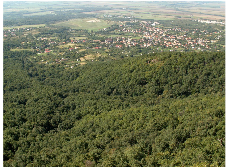
Fig. 2. Landscape from Zsongor-kő (540 m)