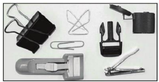
Figure 3. Common compliant devices.

Compliant mechanisms are monolithic structures where the movement is given by the flexibility of the structure rather than the presence of joints and pins. The absence of joints allows the construction of compliant mechanisms in microscale. This kind of mechanism transfer motion, force or energy. Unlike rigid-link mechanisms, compliant mechanism gain at least some of their mobility from the deflection of flexible members rather than from movable joints only. Basically not all the links of the mechanism