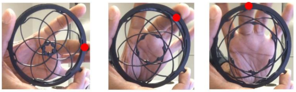
Figure 4. Compliant torsional spring.

need to be flexible for it to be named as a compliant system but some important links must be flexible. Fully compliant mechanisms are very unstable and unreliable.