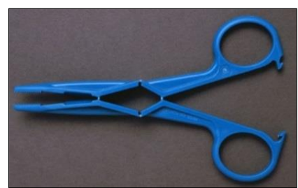
Figure 1. Compliant tweezers.

There are many types of mechanisms nowadays. A mechanism is a device to transfer or transform motion, force or energy. Traditional rigid body mechanisms consist of rigid links connected at movable joints. Whatever machines you see in your day to day life has some underlying mechanisms that govern its motion to produce the desired output. The energy is transfered from the input to the output. Compliant mechanisms have been used for decades in different fields and industries. In particular, robotics, medical or aerospace have been using such mechanisms for some 50 years now, even more. These mechanisms depend on some parameters, like elastic deformations, to provide precise and smooth motions. It is essential to develop an accurate model to quatify the deformation for kinetic analysis and parameter optimization.