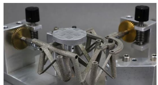
Figure 8. The pointer device

Mechanisms that possess distributed compliance, as opposed to lumped compliance, are much more fatigue resistant and easier to manufacture. Several computational approaches have been developed to design compliant mechanism for desired force-displacement characteristics and more recently for generalized shape change.