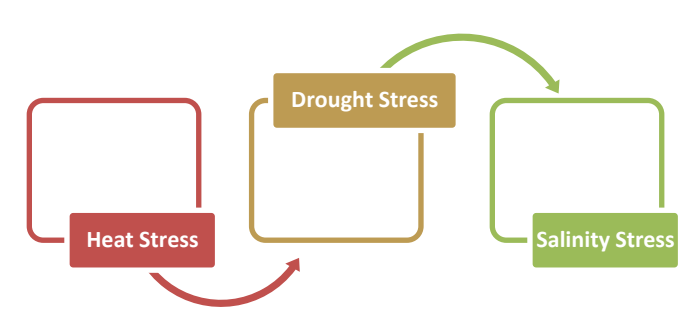
Figure 3. Intertwined relationship of different abiotic stresses

3. Dunlop and Binzel (1996) witnessed a substantial reduction in the amounts of IAA levels of tomato caused by salinity